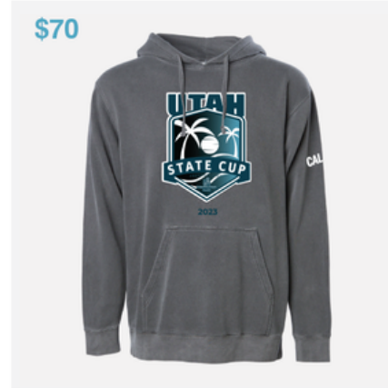
CHARCOAL HOODIE • SIZES S - 2XL