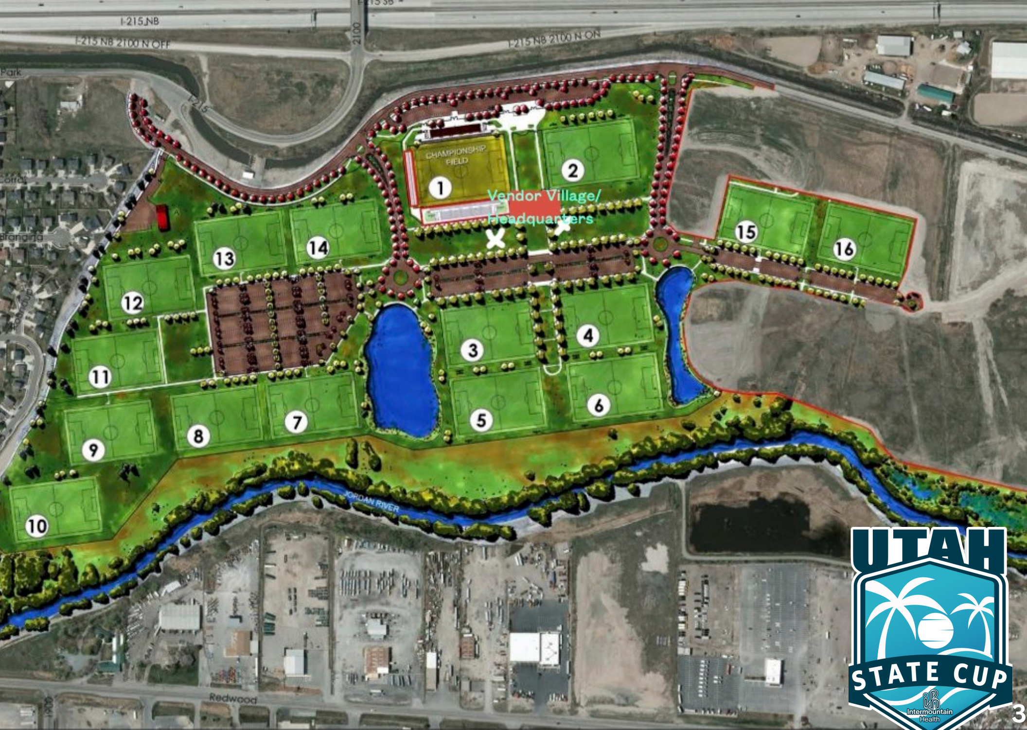
Utah State Cup Athletic Complex Field Map