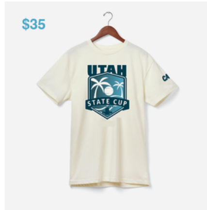
NATURAL TEE • SIZES S - 2XL