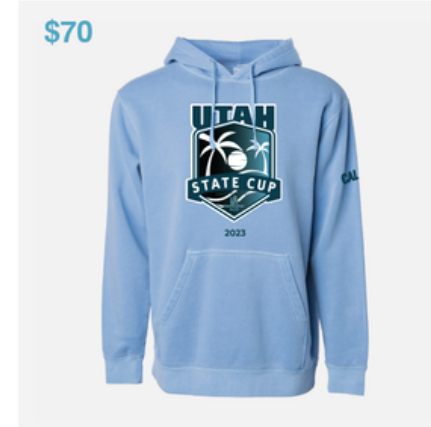
BLUE HOODIE • SIZES S - 2XL